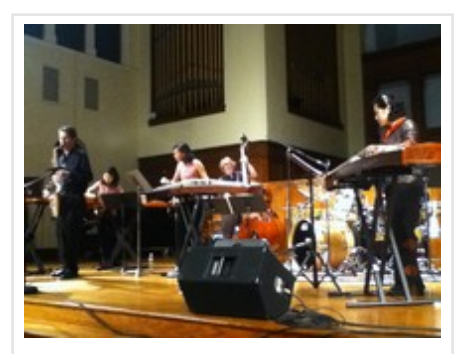
Ultra World X-Tet plays at the Old First Church (O1C) on Sacramento St.

On Friday October 21, The Old First Church (O1C) on Sacramento St. presented Ultra World X-Tet as part of its ongoing concert series.